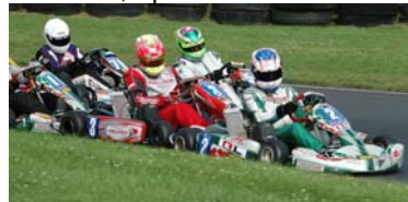
Rotax Max start